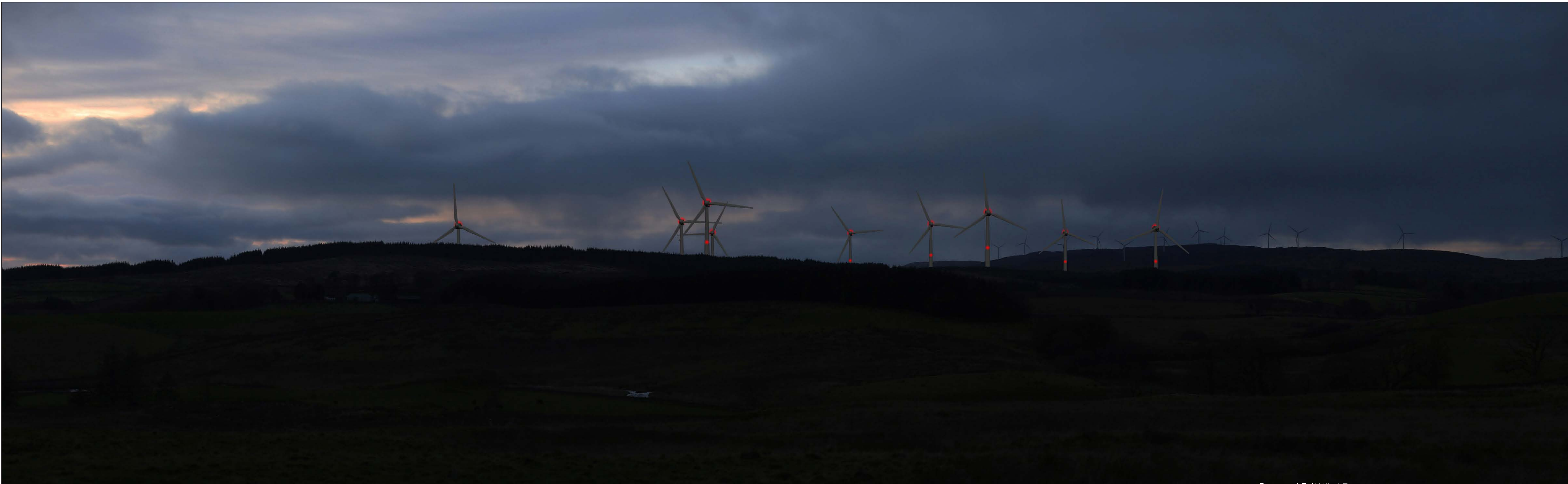
Photomontage (showing baseline with proposed scheme only)

Proposed Fell Wind Farm not visible in the 53.5 degrees photomontage.