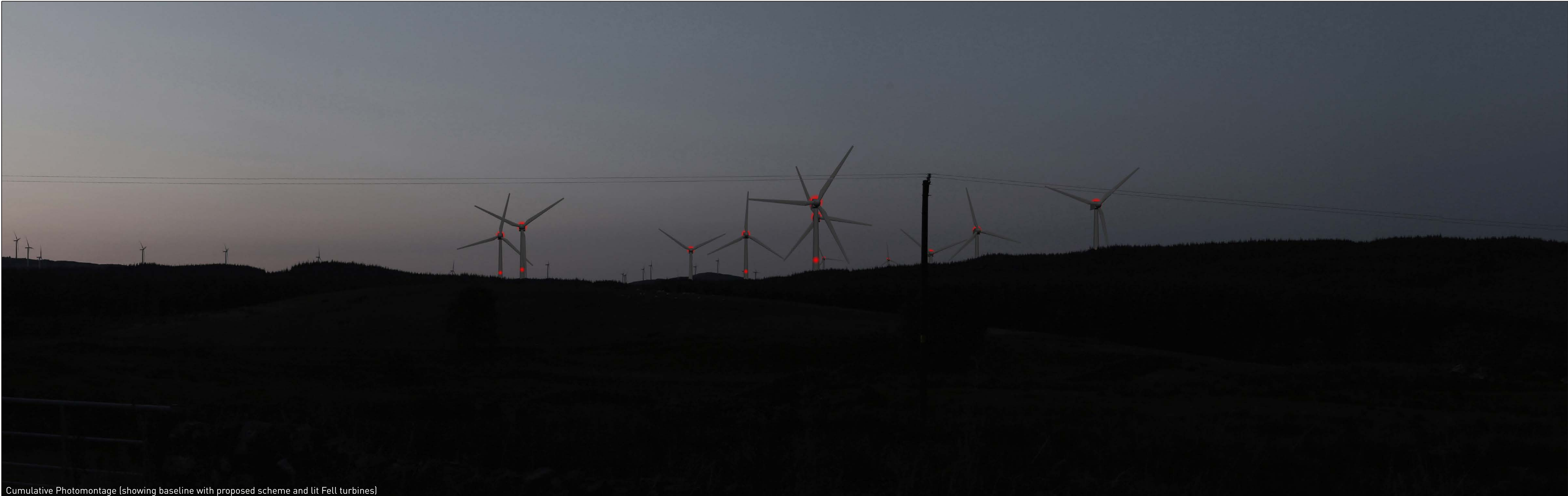
Cumulative Photomontage (showing baseline with proposed scheme and lit Fell turbines)