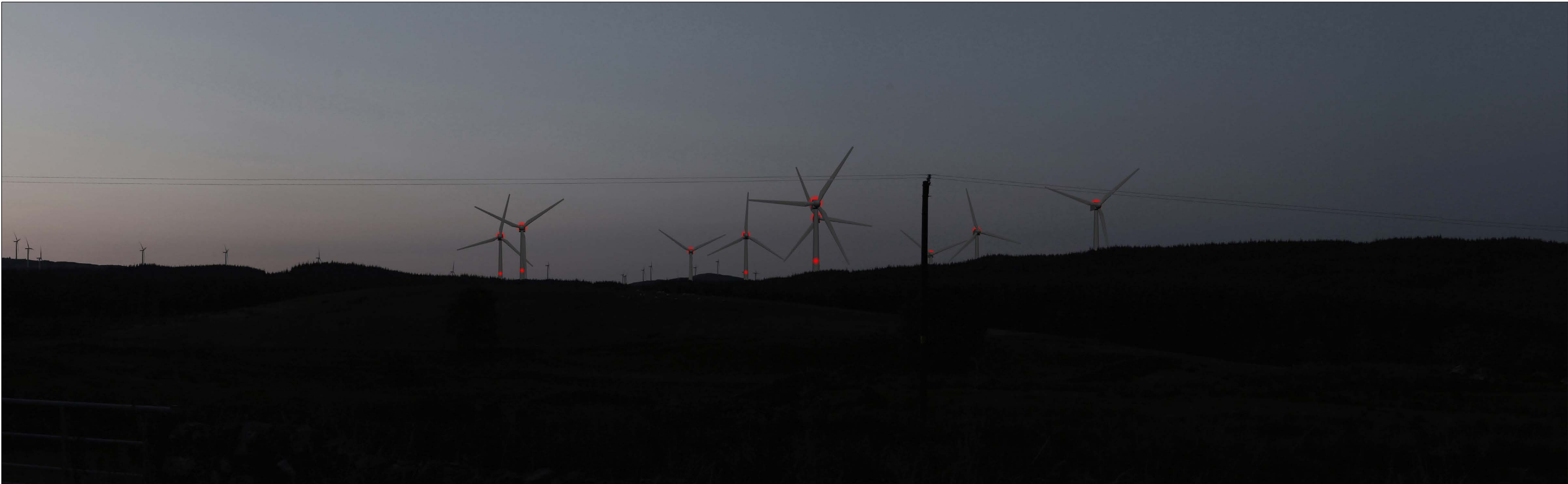
Photomontage (showing baseline with proposed scheme only)