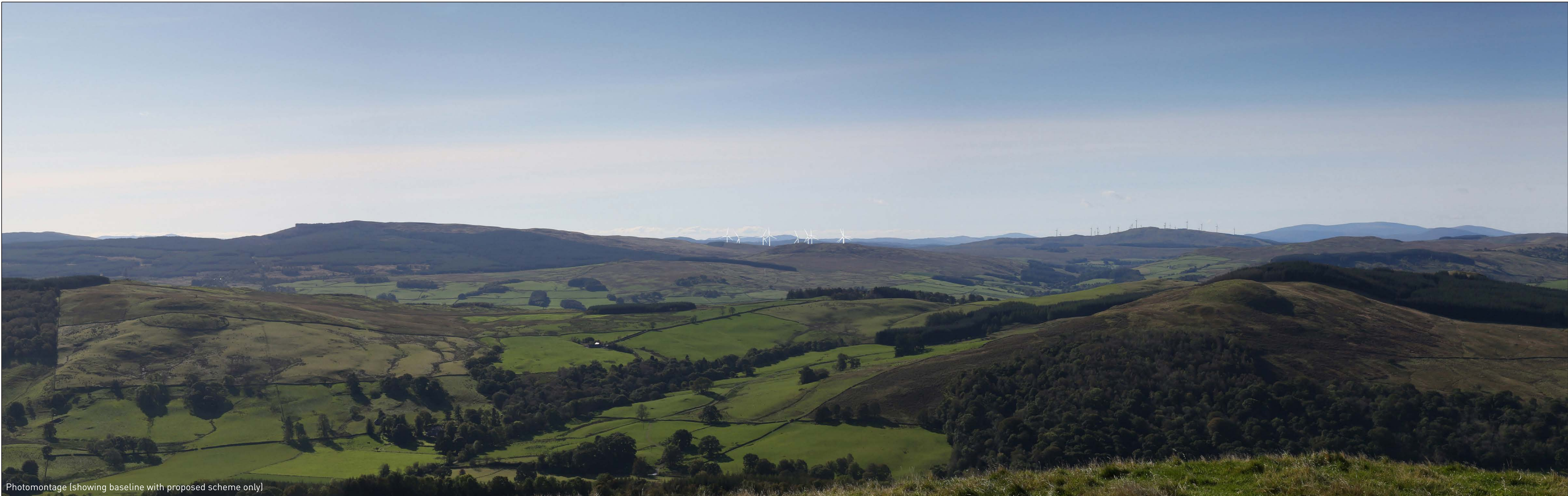
Photomontage (showing baseline with proposed scheme only)

(Sheet C) Viewpoint 8: A712, Auchengibbert Hill Drawing number P20-1257.516 GARCROGO WIND FARM