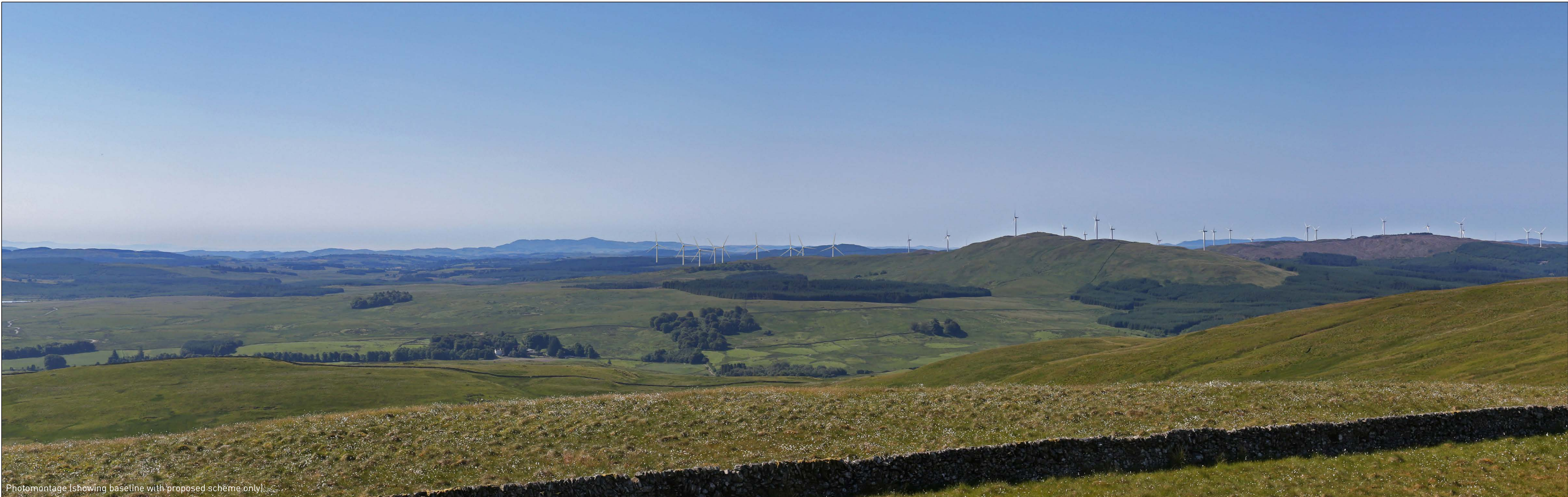
Photomontage (showing baseline with proposed scheme only)

(Sheet C) Viewpoint 19: Big Morton Hill Drawing number P20-1257.509 GARCROGO WIND FARM